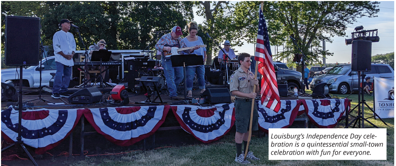
Louisburg's Independence Day celebration is a quintessential small-town celebration with fun for everyone.