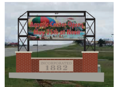
This is the artist's rendering of the new EMC sign that will soon come to Louisburg.