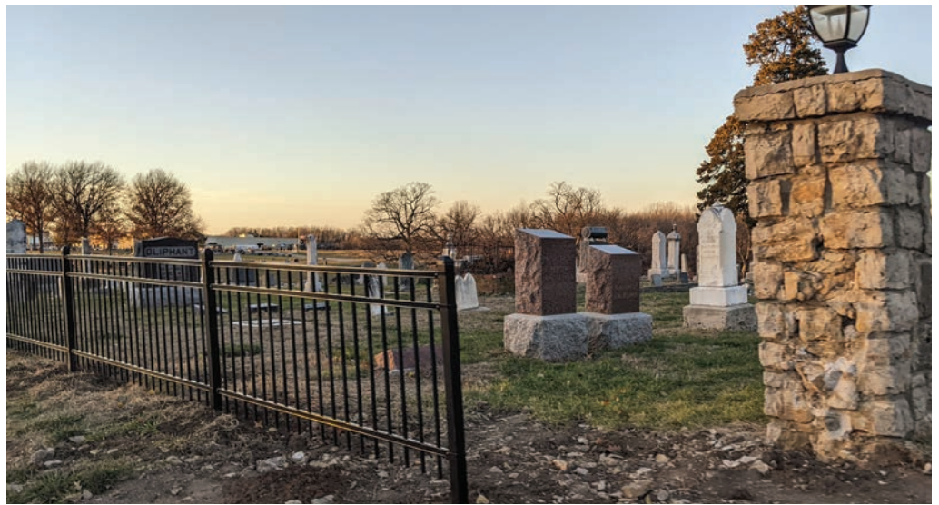
A new fence graces the south side of the old section of the Louisburg Cemetery. The fence replaces a taller fence that was damaged in a motor vehicle accident last fall. At right: A time capsule was recovered during fence work.

The City of Louisburg requires building permits. Please call the Building & Zoning Department at 913-837-5811 before beginning any construction project.