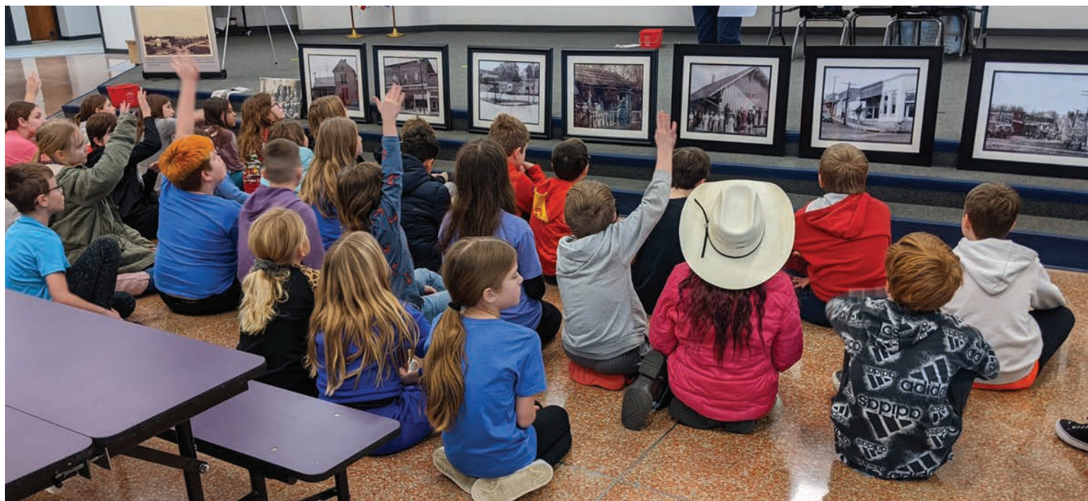
Broadmoor Elementary fourth-graders participate in a discussion during a presentation of the history of Louisburg as part of the a Kansas Day celebration at the school on Jan. 29. Photographs of early Louisburg were shared with the students.