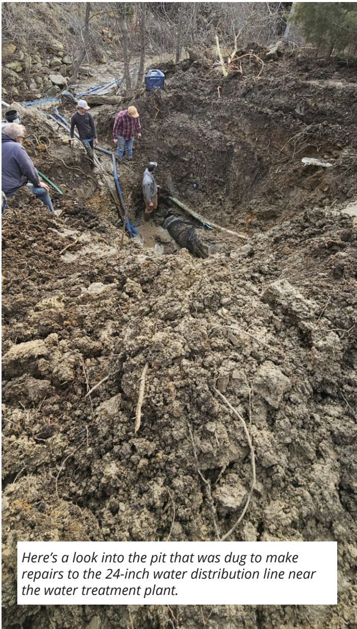
Here's a look into the pit that was dug to make repairs to the 24-inch water distribution line near the water treatment plant.

A water leak at the Marias Des Cygnes Public Utility Authority in early February forced water conservation efforts for the City of Louisburg. The Authority is the jointly operated water treatment plant owned by the cities of Louisburg and Paola and is located on the Marias Des Cygnes river.