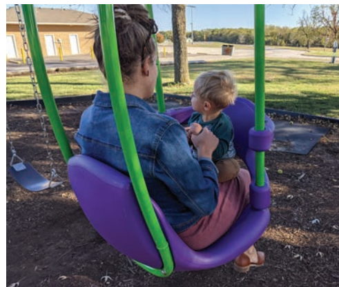
The playground at Lewis-Young Park offers two specialty swings. One is a parent/tot swing, and the other is specifically designed for wheelchair users.