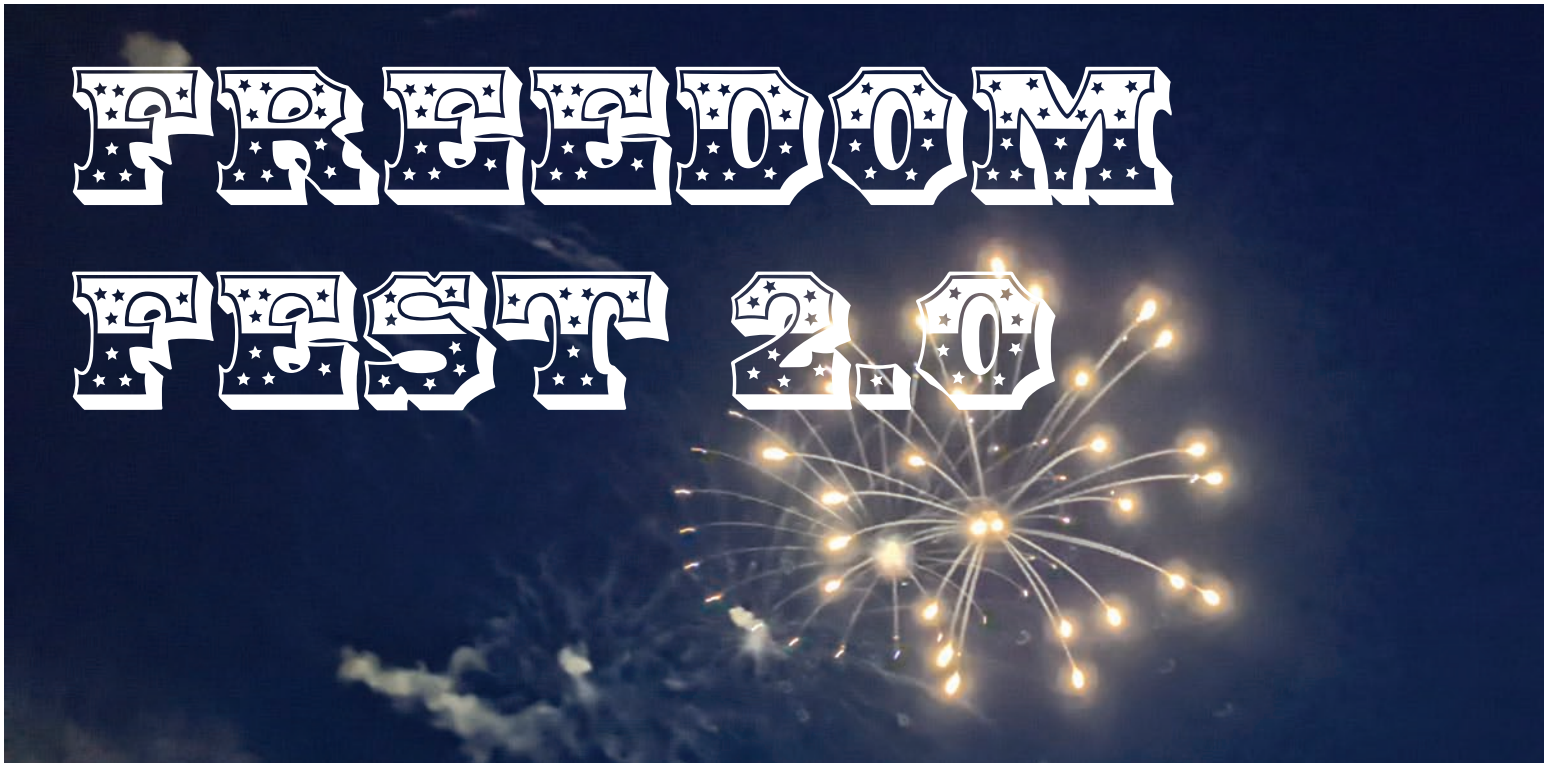
Fireworks lit up the sky at Lewis-Young Park during last year's July Freedom Fest celebration in Louisburg.

Louisburg's 2024 Freedom Fest is being rebranded as Freedom Fest 2.0 and will be celebrated Saturday, Oct. 5 at Lewis-Young Park. The event was canceled July 4 when heavy rains meant the firework set-up could potentially damage the fields at the park.