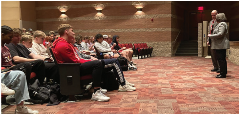
The Supreme Court heard oral argument in Lansing earlier this year.

More information on the event can be found on the Kansas Judicial Branch website: https://bit.ly/4eFC9Qu