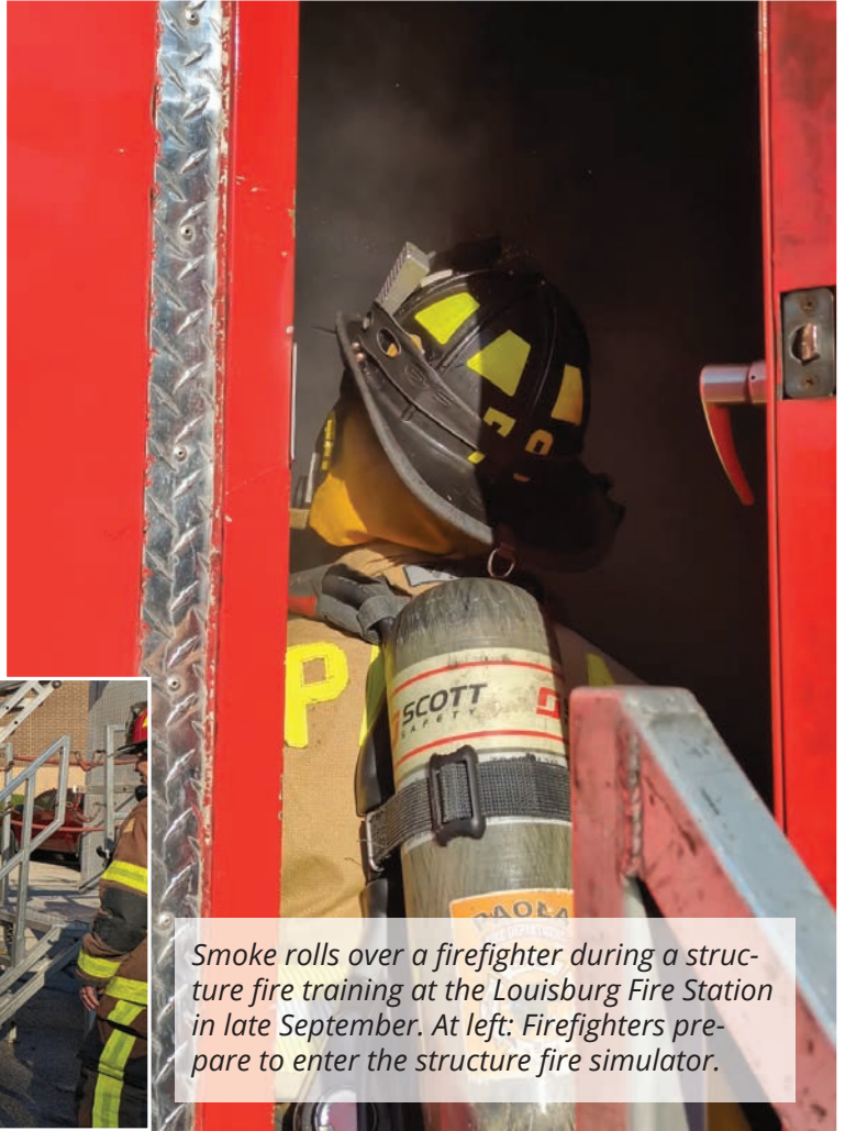
Smoke rolls over a firefighter during a structure fire training at the Louisburg Fire Station in late September. At left: Firefighters prepare to enter the structure fire simulator.

Fire Chief Gerald Rittinghouse said there were 16 firefighters participating in the entry training and four command staff overseeing the drill.